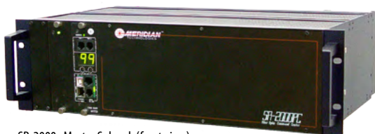
SR-2000 Master Subrack (front view)