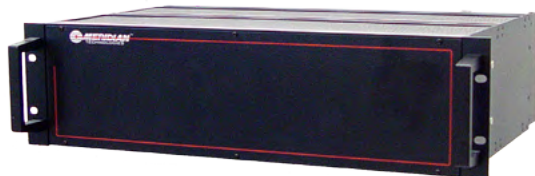
SR-2001 Equipment Chassis (front view)