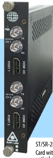
ST/SR-2DM-0/ST Card with ST optical connector