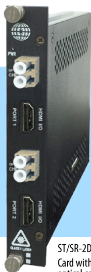
ST/SR-2DM-0 Card with LC optical connector