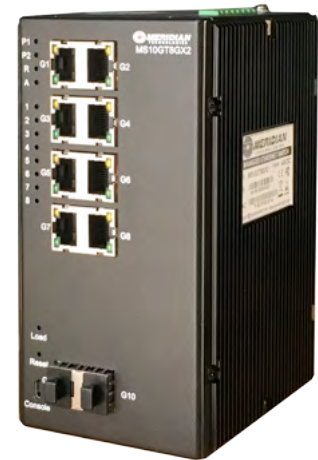
MANAGED ETHERNET SWITCH